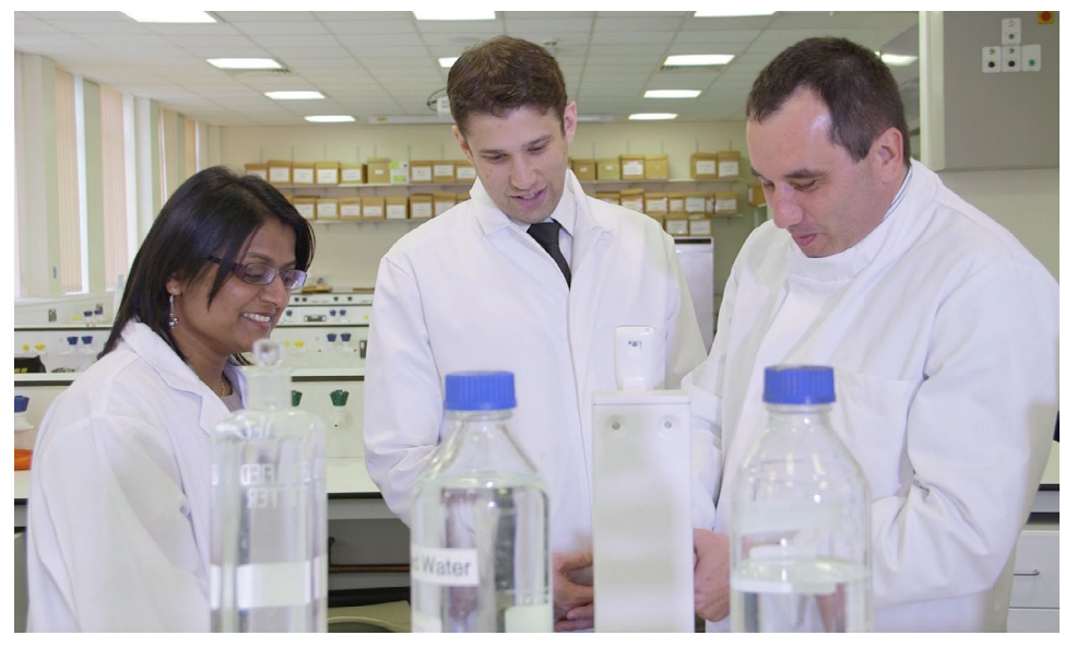
What began as a bold marketing pitch is now saving hospitals from the bacterium Clostridium Difficile.

It also found that one of the two C. diff strains, called 027, produces spores that are highly infectious and resistant, allowing it to survive basic disinfection for weeks. Spores of the bacteria are usually passed out of the body through a person's stool, and once a person touches the surface of a contaminated object, the person could risk being a carrier of the bacteria or becoming infected.