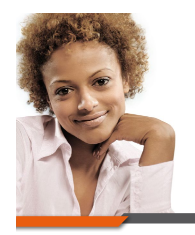
Improved Aerosol Therapy FAVORITE Inhalation

What most researchers did not take into account at that time was the patient's breathing pattern. 'It's very simple. If you don't inhale at all, you will not get anything into the lungs,' Scheuch says. 'You can