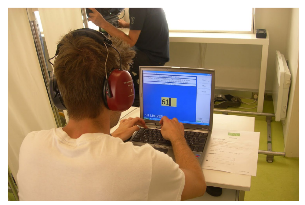
The Digit Triplet Test, the three-minute self-screening method for discovering hearing problems, is now being used in schools and offices.

During the test, 27 triplets are presented. The background noise is set at 65 decibels (dB). At first, the speech in the test is at the same level as the