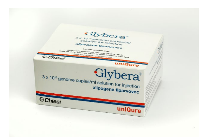
With Glybera, a normal life may no longer be a dream for patients with genetic illnesses.

According to uniQure, Glybera was developed to help patients suffering from a very rare disease: lipoprotein lipase deficiency or LPLD. This particular gene mutation results in hyper-chylomicronemia, or dramatic and potentially life-threatening increases in the level of large fat-carrying particles (chylomicrons)